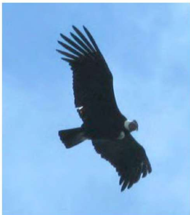
Figure 2. Male Andean Condor photographed on 19 July 2009 at Cerro el Barco.

Double-toothed Kite ( Harpagus bidentatus ). One adult male was collected on 14 June 2009 in tall evergreen forest along the trail from the Campo Verde to Cotrina Police Stations. This represents the first record of the species for western Peru, and a major southward range extension from previous sight records in central Guayas, n. Los Ríos, and w. Chimborazo, Ecuador (Ridgely & Greenfield 2001).